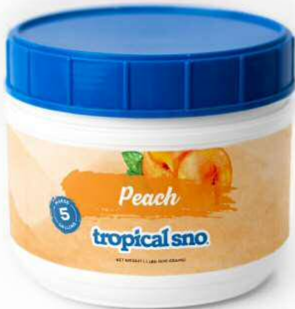
Small Canister Makes 5 Gallons