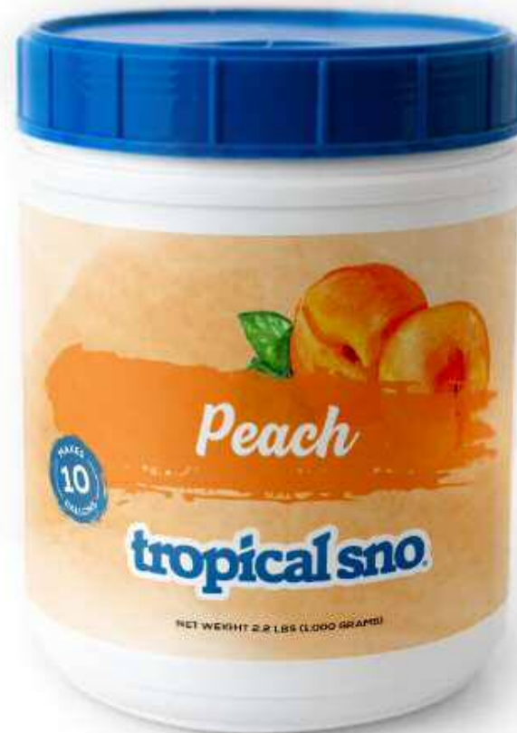
Large Canister Makes 10 Gallons